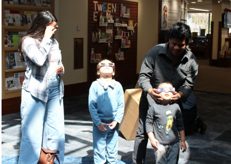
HPL welcomed hundreds of skygazers of all ages to our Eclipse Viewing Party on Monday, April 8.